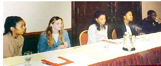
?Y Central Teens as School Board Speakers

In February 2002, an essential partnership began: ?Y youth and adults met with a Durham County school board member who privately supported TFS. The member shared information on strategies for creating support for policy on the school board and reviewed the history of support for the current policy. Staff from the NC Tobacco Prevention and Control Branch (TPCB) held a meeting with ?Y Director and the Assistant Superintendent to share information about the TFS movement and the letters of support from public officials. The ?Y Director also presented to the Durham School Wellness Committee in hopes of receiving a letter of support, which unfortunately did not materialize.